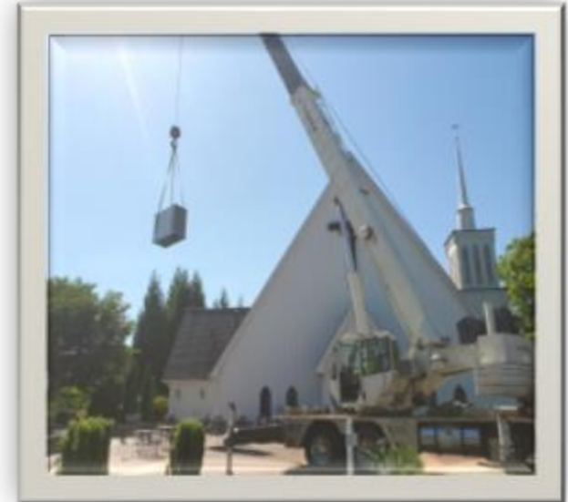
Replacement of Air Conditioning Unit

Thank you for your continued support for St. Paul the Apostle Catholic Church.